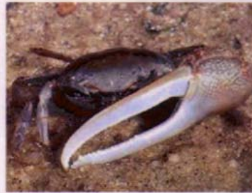
Fiddler Crab ( Uca pugnax )

The male fiddler crab plays violin. When he takes bites with his smaller claw, it looks like he’s pulling a bow across his larger claw or his “fiddle.”